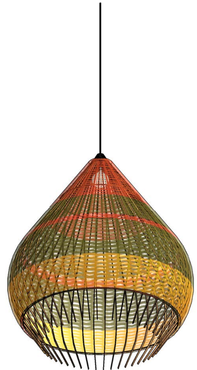
3 PL2 3D VIEW