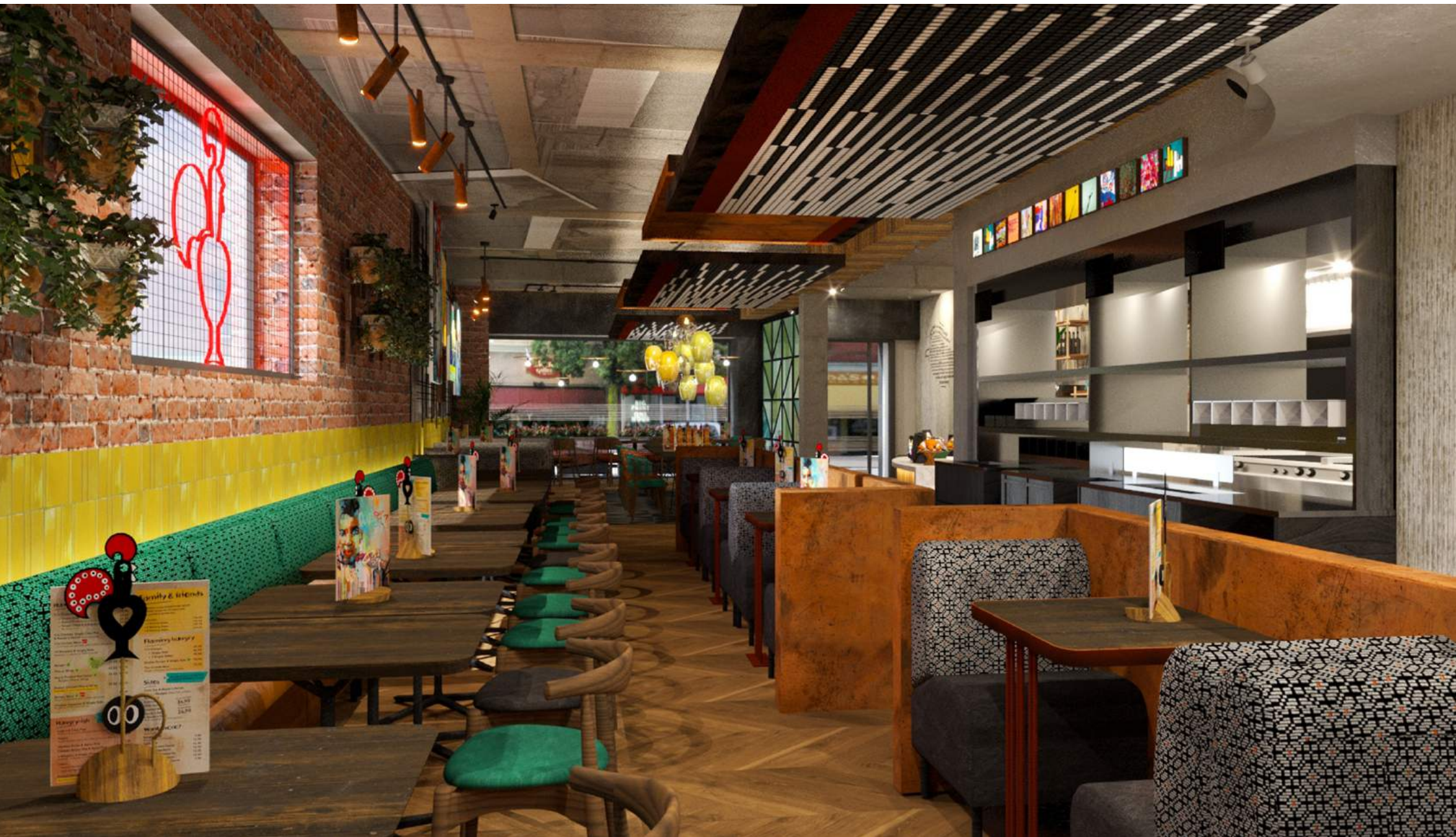
Interior Visual 1