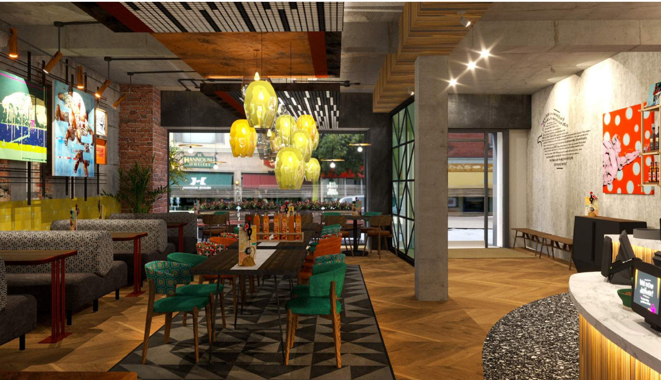
Interior Visual 2