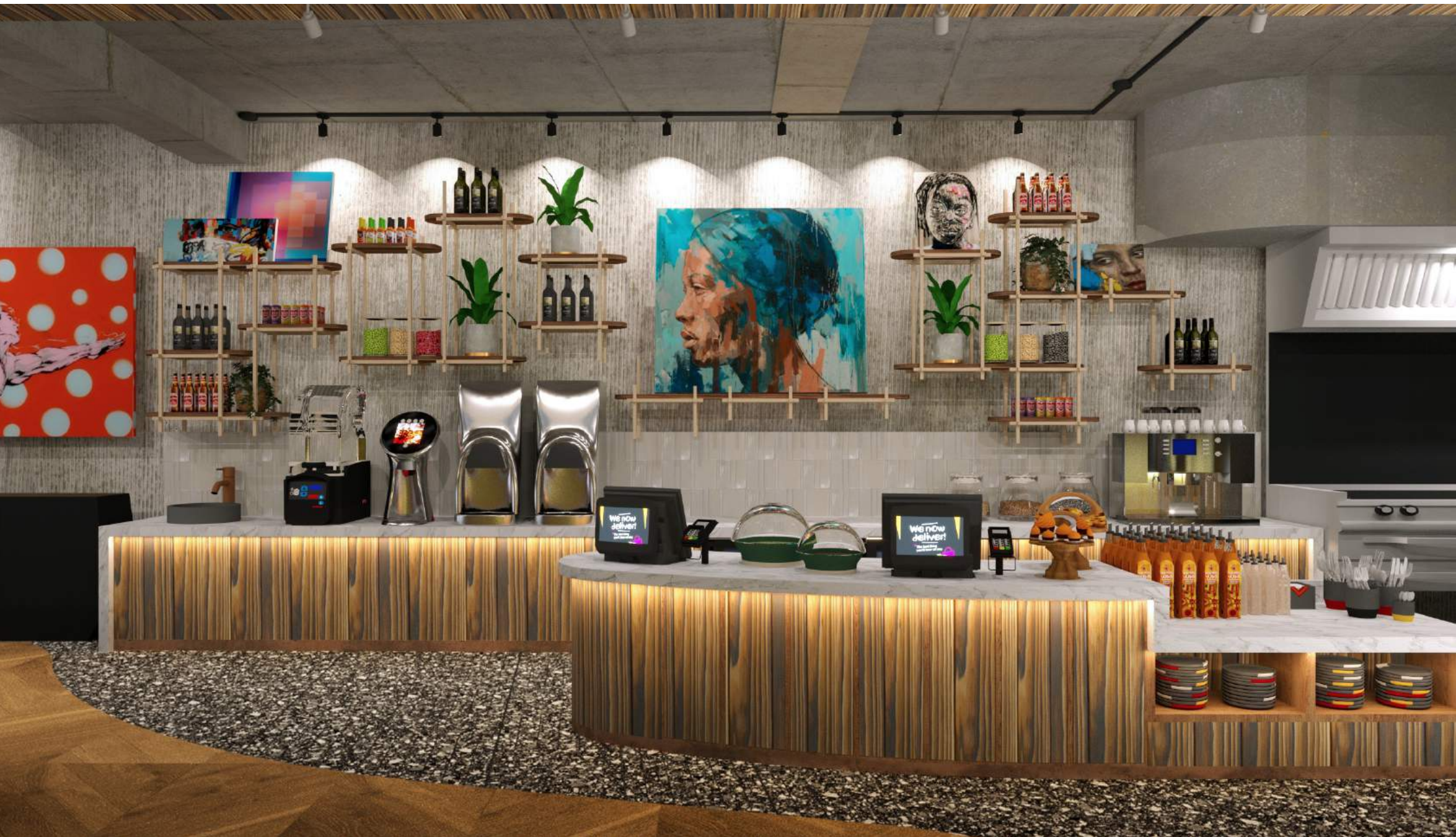
Interior Visual 4